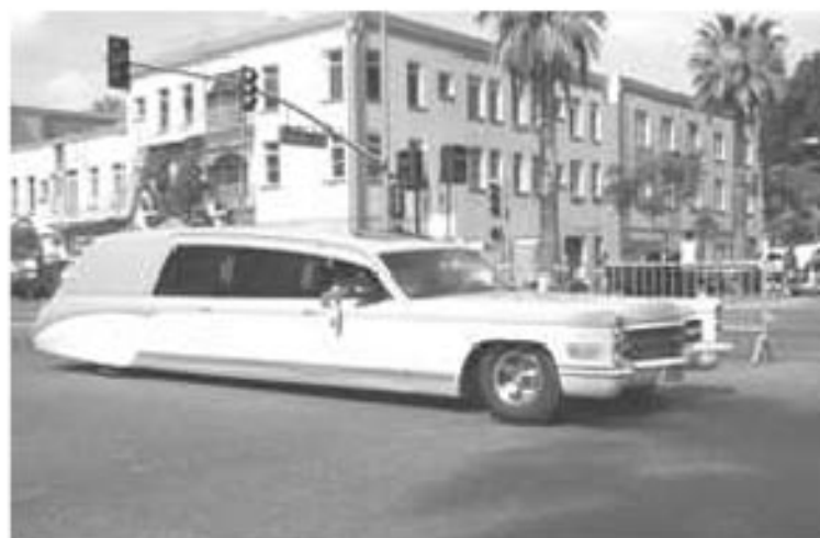
Show & Go is always all about variety<<<

Thanks everyone again – I'll see you in 2008!