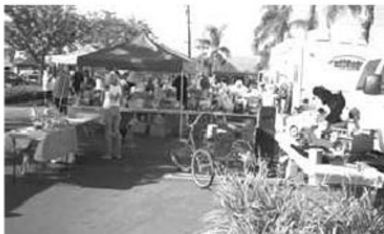
>>>There were raffle prizes galore at the event!

Our car show was a great success!! We had 132 cars and raised 5,300 dollars for Multiple Sclerosis. On behalf of the Dream Cruise Committee, We would like to THANK-YOU all for the extra support that you gave us this year. Your participation and your words on the cruise hot line as well as your web site showed us how much you cared and that you gave us 100% of your support. The Dream Cruise Committee thinks that you are all very special people!!!! Thank- you again and we hope to see you all next year.