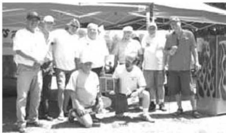
>Old Farts of the year Present & Past-